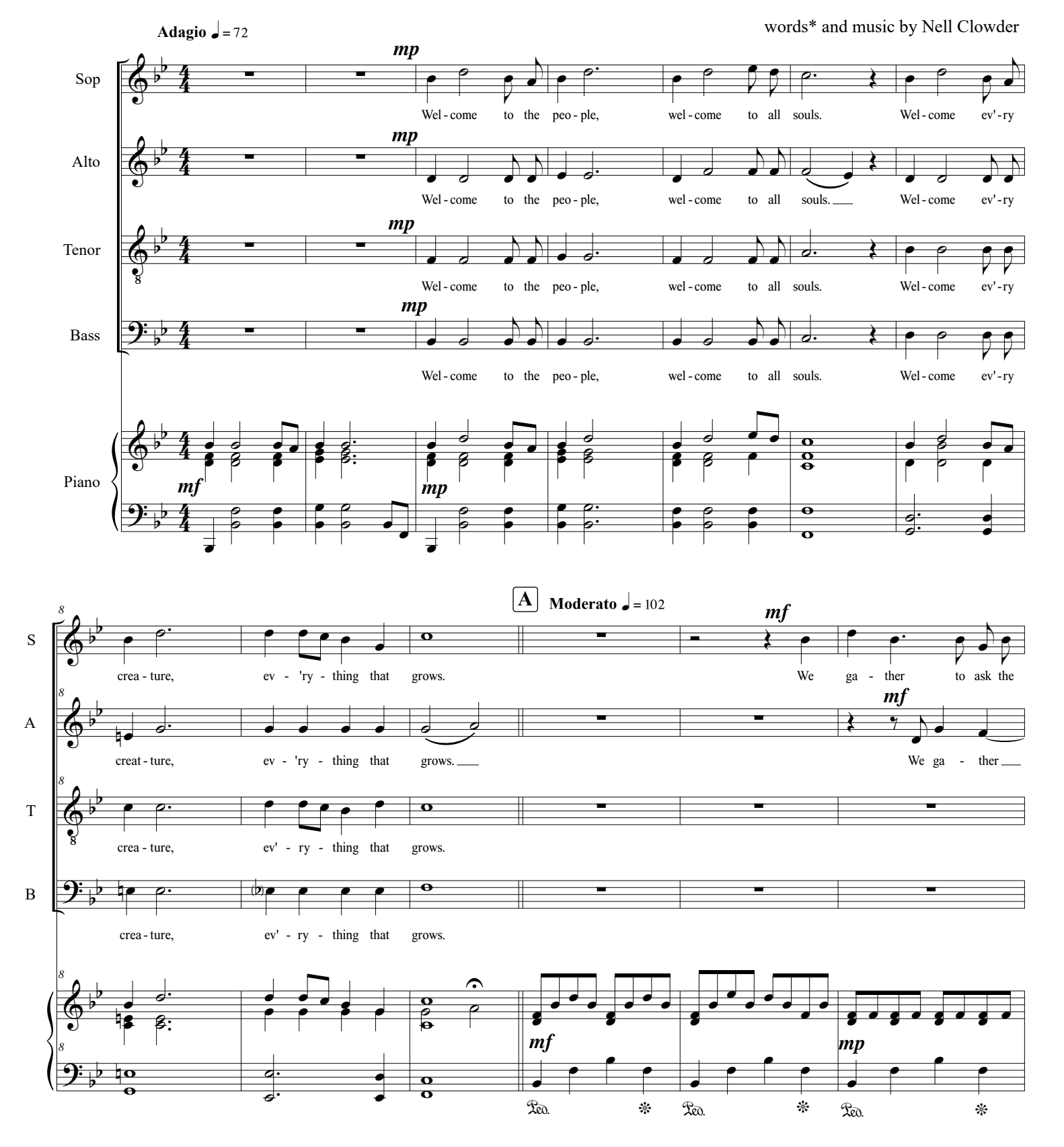
words* - it's ok to change a few words to fit an occasion or timely circumstances. For example, if performing at a retirement home, you might want to welcome the young and the old. Words must be inclusive and keep the spirit of the original text. Acknowledge any such changes thus: "words and music by Nell Clowder, some words adapted by <mychorus>"